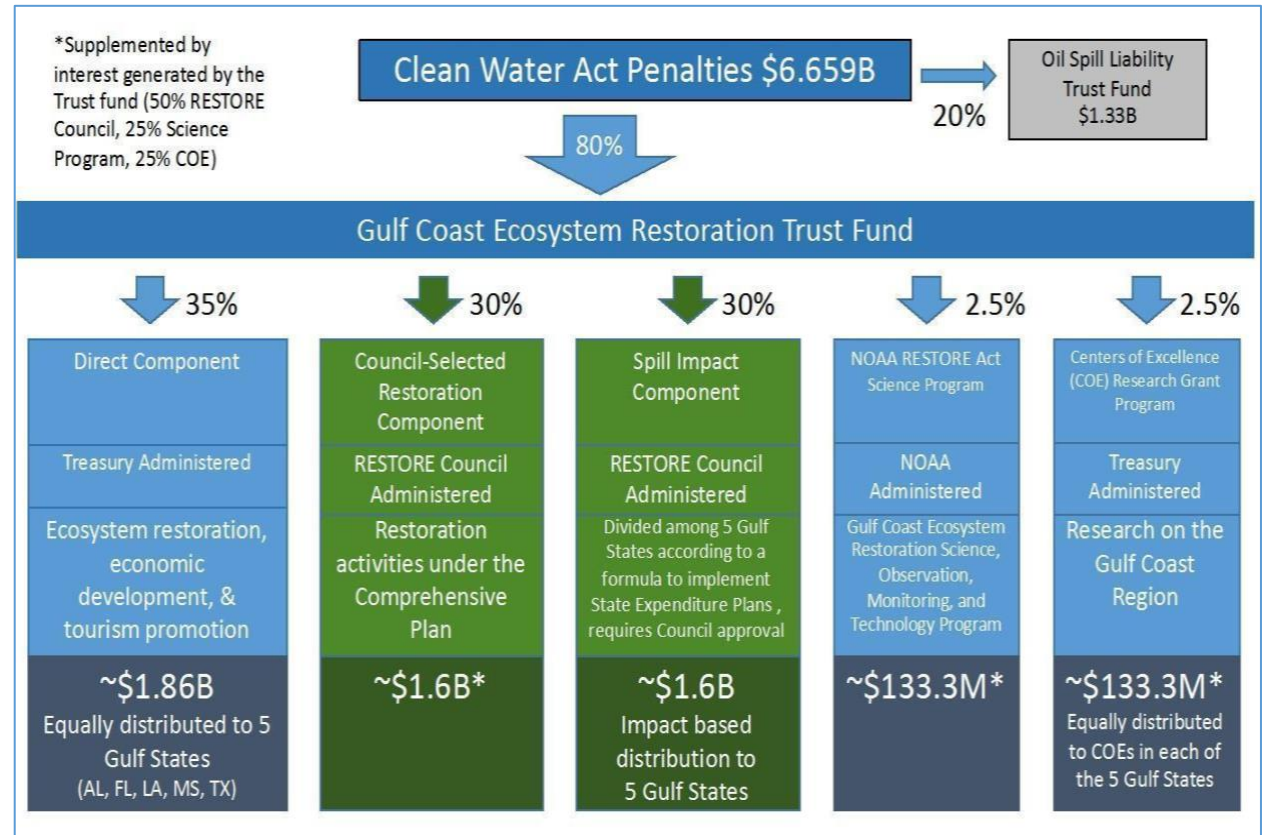
Figure 1 . Allocation of the Gulf Coast Restoration Trust Fund based on settlements with BP, Transocean and Anadarko; RESTORE Council oversight components are highlighted in green.

The RESTORE Act directs the Council to use the best available science and give highest priority to ecosystem projects and programs that meet one or more of the following four Priority Criteria. The Council will use these criteria to evaluate proposals and select the best projects and programs to achieve comprehensive ecosystem restoration, which include.